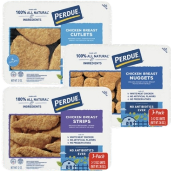
PERDUE(3 PACK) A-STRIPS $13.00 B-NUGGETS $13.00 C-CUTLETS $13.00