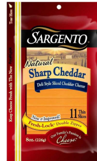
Sargento Sharp Cheddar $5.00