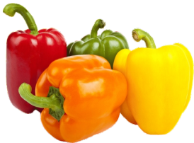
BELLPEPPER COMBO $5.00