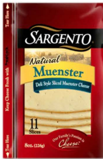
Sargento Muenster $5.00