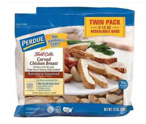
PERDUE CHICKEN SHORTCUTS(TWINPACK) $13.00