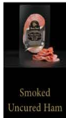
Smoked Uncured Ham SMOKED UNCURED HONEYHAM