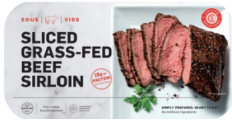
BEEF SIRLOIN $25.00