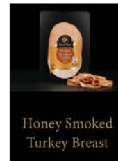
Honey Smoked Turkey Breast HONEY SMOKED TURKEY BREAST