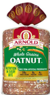
Arnold Oatnut $ 5.00