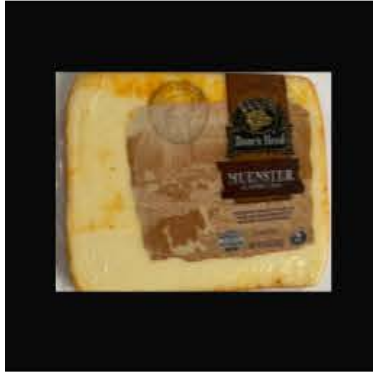
Boars Head Muenster $6.00