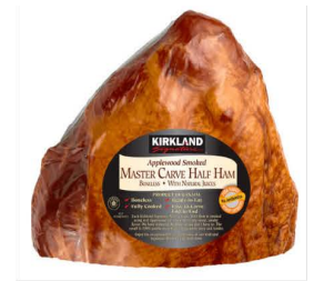
KIRKLAND CARVED HALF HAM $18.00