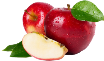
APPLE (RED) $3.75