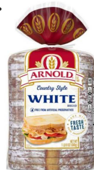
Arnold White $5.00