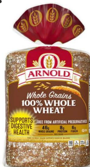
Arnold Whole Wheat $5.00