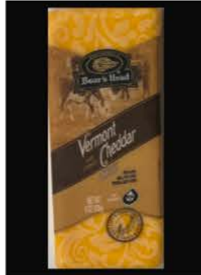
Boars Head Vermont Cheddar $6.00