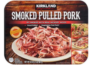
KIRKLAND SMOKED PULLED PORK $16.00