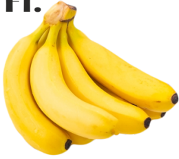
BANANA BUNCH $2.25