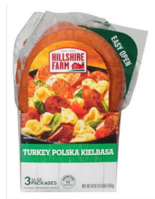
HILLSHIRE FARM KIELBASA(3PACK) $17.50