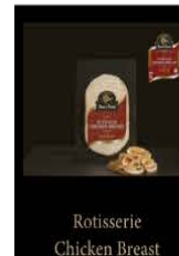
Rotisserie Chicken Breast CHICKEN BREAST