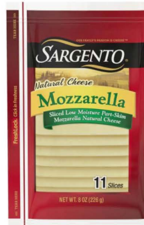
Sargento Mozzarella $5.00