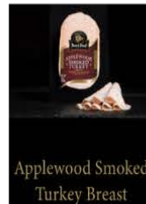
Applewood Smoked Turkey Breast SMOKED TURKEY BREAST