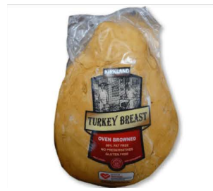
KIRKLAND TURKEY BREAST $20.00