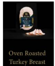
Oven Roasted Turkey Breast ROASTED TURKEY BREAST