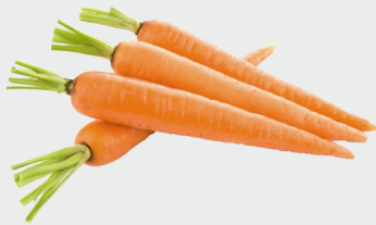
CARROT $ 3.75