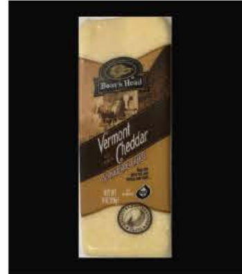
Boars Head Vermont White Cheddar $6.00