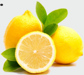
LEMON/LIME MIX $7.00/32oz