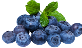
BLUEBERRY $7.00/18 oz